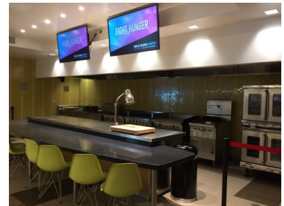
64° demonstration kitchen